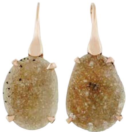
KJFC93-RG Rose Gold-Plated 1-Micron .925 Silver Fancy Dreusy Earrings