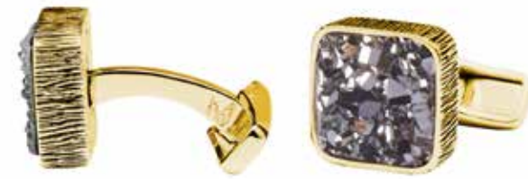
CFL50BKDRY-YG Black Dreusy Agate Yellow Gold-Plated Bronze Cufflinks