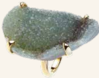
KJFC48R-YG 18k Yellow Gold 1-Micron .925 Silver Fancy Dreusy Ring

Set in .925 Silver plated to 1 micron with Rhodium, 18k Yellow Gold, Rose Gold or Black Rhodium. The Fancy Dreusy colours and styles will be similar to the samples but never exactly the same. Available in sets of 6 or 12 unique rings.