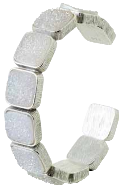
KJ125WLTBg-RH Rhodium-Plated .925 Silver Titanium Coated White Agate Bangle