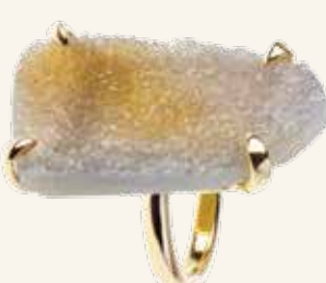
KJFC48R-YG 18k Yellow Gold 1-Micron .925 Silver Fancy Dreusy Ring