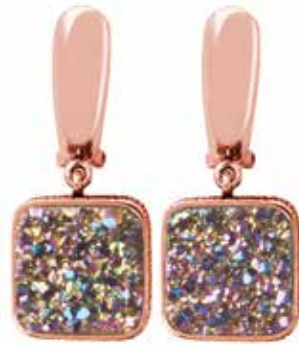
KJ84FLTE-RG Rose Gold-Plated Bronze Earring & Titanium Fancy-Coated Dreusy Agate