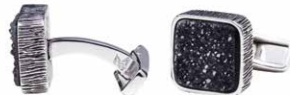
CFL50BKDRY-RH Black Dreusy Rhodium-Plated Bronze Cufflinks