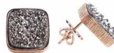
KJ48TDLTES-RG Rose Gold-Plated Titanium Coated Agate Stud Earring