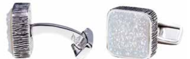
CFL50WDRY-RH Titanium-Coated White Dreusy Agate Rhodium-Plated Bronze Cufflinks