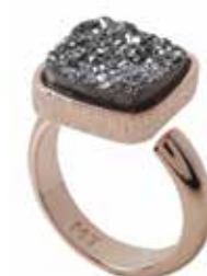
KJ28CHLTR(L)-RG KJ22CHLTR(S)-RG Rose Gold-Plated Grey Dreusy Agate Ring