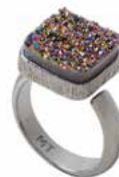
KJ28FLTR(L)-BK KJ22FLTR(S)-BK Black Rhodium-Plated Bronze Titanium Coated Deusy Agate Ring