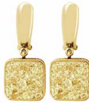
KJ84CHLTE-YG 18k Yellow Gold-Plated Bronze Earring & Titanium-Coated Champagne Dreusy Agate