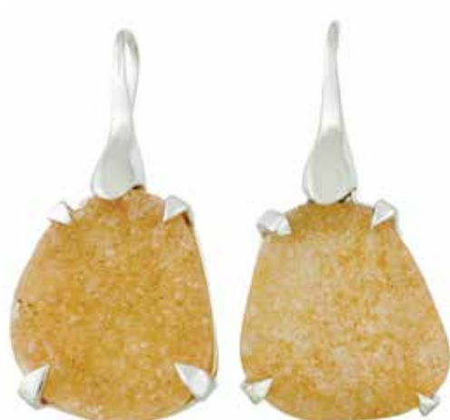
KJFC93-RH 18k Rhodium-Plated 1-Micron .925 Silver Fancy Dreusy Earrings