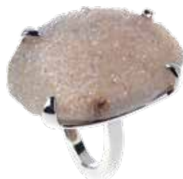
KJFC48R-RH Rhodium-Plated 1-Micron .925 Silver Fancy Dreusy Ring