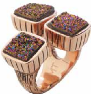
KJ85FLTR-RG Rose Gold-Plated Bronze Ring & Titanium-Coated Fancy Dreusy