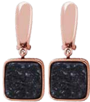
KJ84BLTE-RG Bronze Rose Gold-Plated Black Dreusy Agate