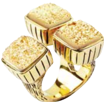
KJ85CHLTR-YG 18k Yellow Gold-Plated Bronze Ring Titanium-Coated Champagne Dreusy Agate