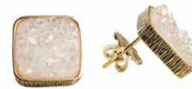
KJ48WLTES-AN Antique Gold-Plated White Agate & .925 Silver Stud Earrings