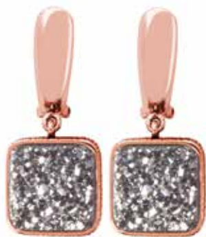
KJ84TDLTE-RG Rose Gold-Plated Bronze Earring & Titanium-Coated Grey Dreusy Agate