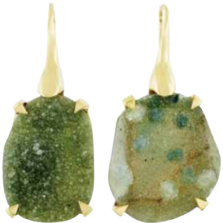
KJFC93-YG 18k Yellow Gold-Plated 1-Micron .925 Silver Fancy Dreusy Earrings