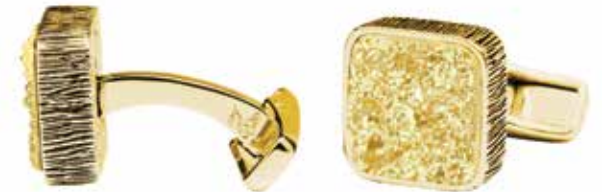
CFL50GDRY-YG Champagne Titanium-Coated Dreusy Agate Yellow Gold-Plated Bronze Cufflinks