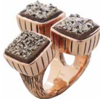
KJ85DLTR-RG Rose Gold-Plated Bronze Ring Titanium-Coated Grey Dreusy Agate