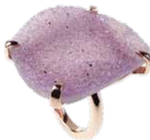
KJFC48R-RG Rose Gold-Plated 1-Micron .925 Silver Fancy Dreusy Ring