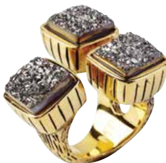
KJ85DLTR-YG 18k Yellow Gold-Plated Bronze Ring & Titanium-Coated Grey Dreusy Agate