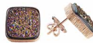
KJ48FLTES-RG Rose Gold-Plated Fancy Coated Agate Stud Earring