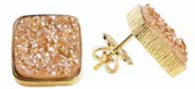
KJ48CHLTES-YG 18k Yellow Gold-Plated Titanium Coated Champagne Dreusy Agate & .925 Silver Stud Earring