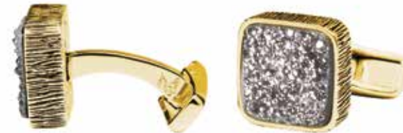
CFL50BKDRY-YG Titanium-Coated Grey Dreusy Agate Yellow Gold-Plated Bronze Cufflinks