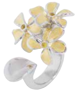
KJ88FPTR Frangipani Ring

In .925 Silver plated with 18k Gold and Rhodium accented with Yellow Citrines.