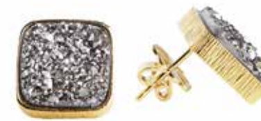
KJ48TDLTES-YG 18k Yellow Gold-Plated Titanium Coated Agate Stud Earring