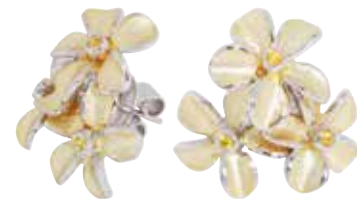
KJ176FPTE Frangipani Earrings