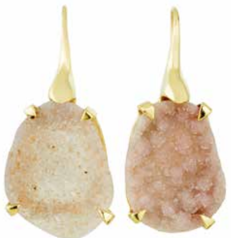
KJFC93-YG 18k Yellow Gold-Plated 1-Micron .925 Silver Fancy Dreusy Earrings