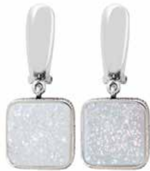
KJ84WLTE-RH Rhodium-Plated Bronze Earring & White Titanium-Coated Dreusy Agate