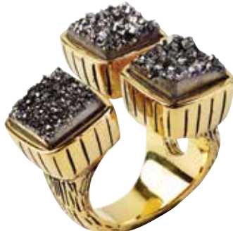
KJ85BLTR-YG 18k Yellow Gold-Plated Bronze Ring & Black Dreusy Agate