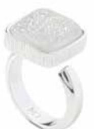
KJ28WLTR(L)-RH KJ22WLTR(S)-RH Rhodium-Plated Bronze White Titanium Coated Dreusy Agate Ring