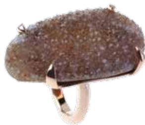
KJFC48R-RG Rose Gold-Plated 1-Micron .925 Silver Fancy Dreusy Ring