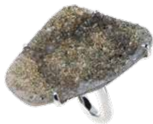
KJFC48R-RH Rhodium-Plated 1-Micron .925 Silver Fancy Dreusy Ring