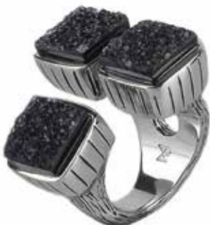
KJ85BLTR-RH Rhodium-Plated Bronze Ring & Black Dreusy Agate

A single stark, burnt tree on a dirt road in Patagonia provides the inspiration for this collection.