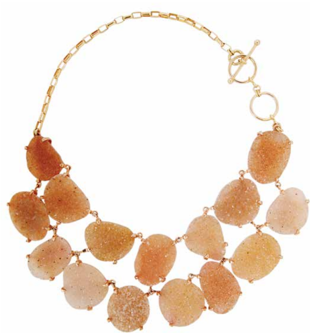
KJDR520N-RG Rose Gold-Plated 1-Micron .925 Orange Agate Druzy Necklace