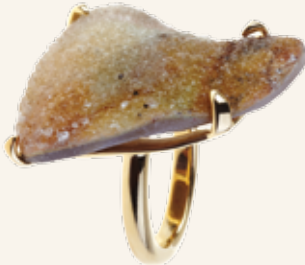
KJFC48R-YG 18k Yellow Gold 1-Micron .925 Silver Fancy Dreusy Ring