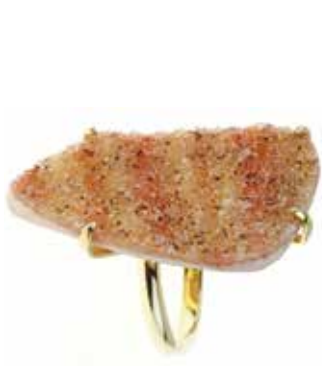
KJFC48R-RG Rose Gold-Plated 1-Micron .925 Orange Agate Druzy Ring

Available in Rhodium and Rose Gold finish. Dreusy will be similar to samples but never exactly the same.