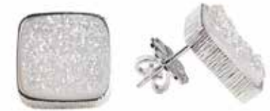
KJ48WLTES-RH Rhodium-Plated White Agate & .925 Silver Stud Earring