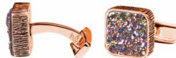
CFL50FDRY-RG Titanium Fancy-Coated Dreusy Agate Rose Gold-Plated Bronze Cufflinks