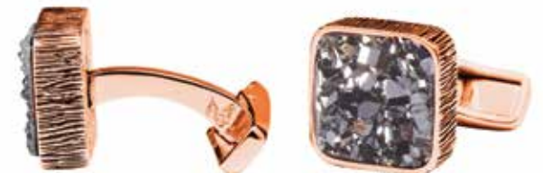
CFL50TGDY-RG Titanium-Coated Grey Dreusy Agate Rose Gold-Plated Bronze Cufflinks