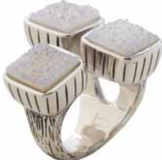
KJ85WLTR-RH Rhodium-Plated Bronze Ring White Titanium-Coated Dreusy Agate