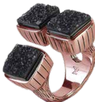
KJ78BLTR-RG Rose Gold-Plated Bronze Ring & Black Dreusy Agate