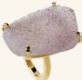
KJFC48R-YG 18k Yellow Gold 1-Micron .925 Silver Fancy Dreusy Ring