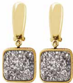
KJ84TDLTE-YG 18k Yellow Gold-Plated Bronze Earring & Titanium-Coated Grey Dreusy Agate