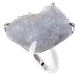
KJFC48R-RH Rhodium-Plated 1-Micron .925 Silver Fancy Dreusy Ring