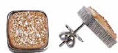
KJ48CHLTES-BK Black Rhodium-Plated Titanium Coated Champagne Dreusy Agate & .925 Silver Stud Earring