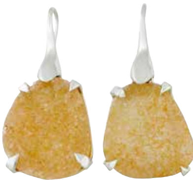
KJFC93-RH Rhodium-Plated 1-Micron .925 Orange Agate Druzy Earrings