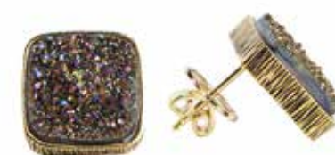
KJ48FLTES-AN 18k Antique Gold-Plated & .925 Silver Stud Earring