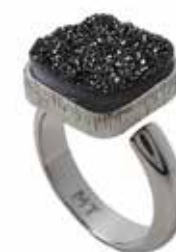
KJ28BLTE(L)-RH KJ22BLTE(S)-RH Rhodium-Plated Bronze Black Dreusy Agate Ring