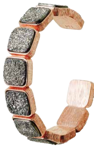
KJ125DLTBG-RG Rose Gold-Plated .925 Silver Titanium Coated Grey Agate Bangle