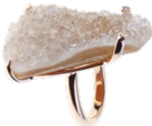
KJFC48R-RG Rose Gold-Plated 1-Micron .925 Silver Fancy Dreusy Ring