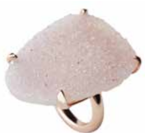
KJFC48R-RG Rose Gold-Plated 1-Micron .925 Silver Fancy Dreusy Ring