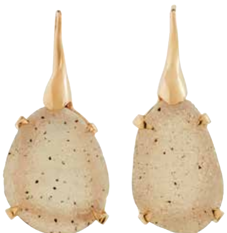
KJFC93-RG Rose Gold-Plated 1-Micron .925 Silver Fancy Dreusy Earrings