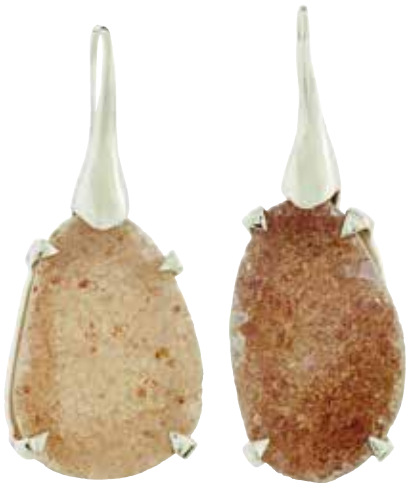
KJFC93-RH 18k Rhodium-Plated 1-Micron .925 Silver Fancy Dreusy Earrings