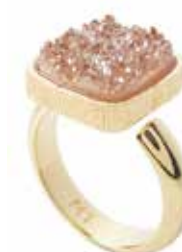
KJ22CHLTR(L)-YG KJ22CHLTR(S)-YG 18k Yellow Gold-Plated Bronze Titanium Coated Yellow Dreusy Agate Ring