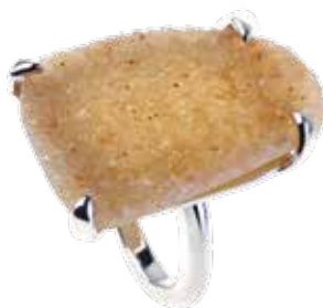
KJFC48R-RH Rhodium-Plated 1-Micron .925 Silver Fancy Dreusy Ring

The earrings are either matched for colour or size but cannot guarantee that it will be both as each stone is unique.