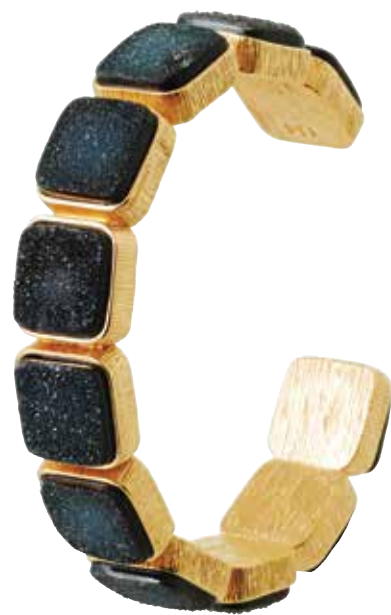
KJ125BLTBg-YG 18k Yellow Gold-Plated .925 Silver Titanium Coated Black Agate Bangle