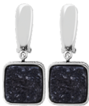
KJ84BLTE-RH Rhodium-Plated Bronze Earrings & Black Dreusy Agate