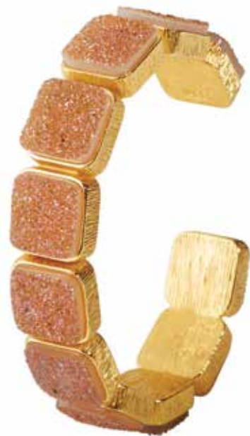
KJ125DLTBG-RG Rose Gold-Plated .925 Silver Titanium Coated Champagne Dreusy Agate Bangle