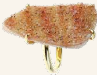
KJFC48R-YG 18k Yellow Gold 1-Micron .925 Silver Fancy Dreusy Ring