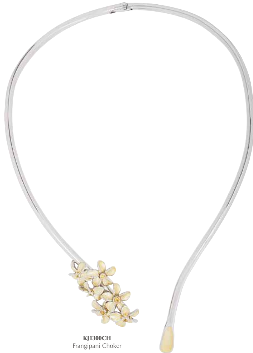
KJ1300CH Frangipani Choker